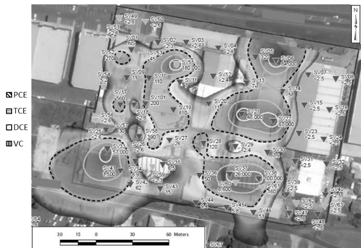
Figure 1. Typical PCE, TCE/DCE and VC dominated soil-vapour results, showing variability in contaminant type/degradation; and example isopleth plot for TCE in soil-vapour (dotted line represents adopted criterion, units in μg/m 3 ) (after SiREM 2015)