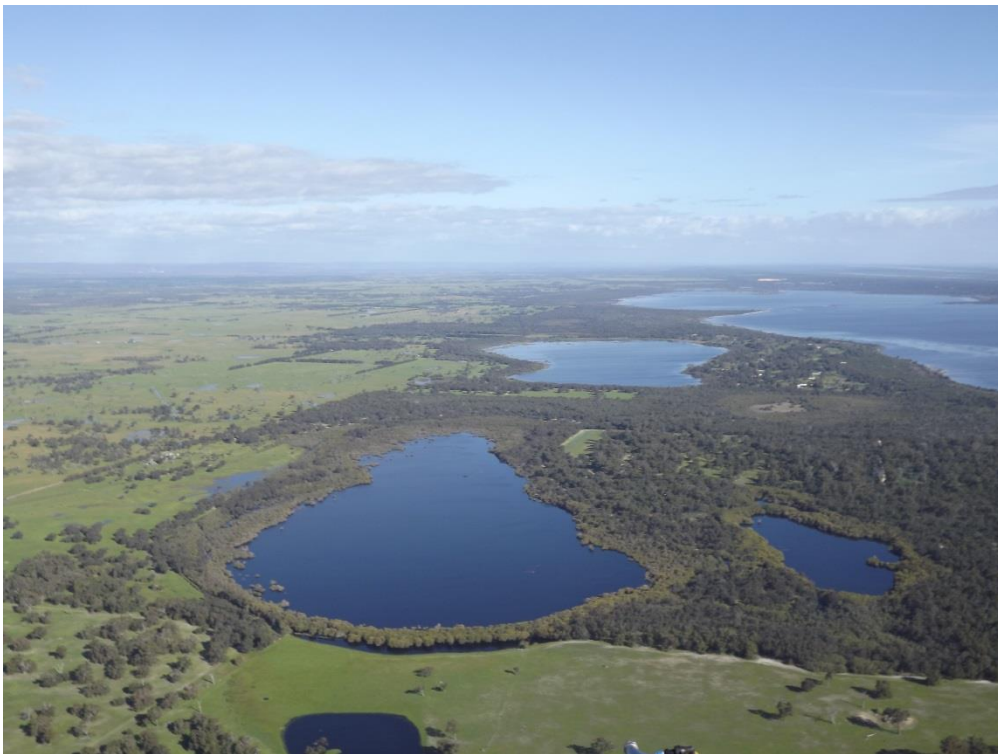
Photo: Lake Mealup aerial looking SW direction with Lakes McLarty and Harvey Estuary in the background: September 2013