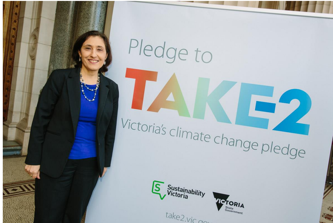
Minister for Energy, Environment, and Climate Change Hon Lily D'Ambrosio