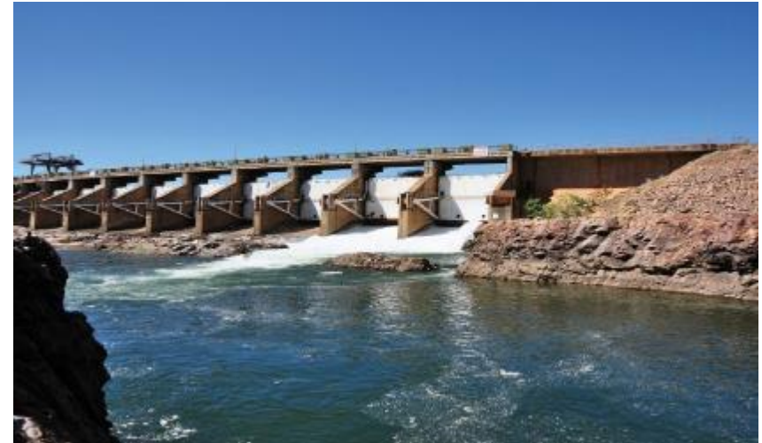
Ord River Dam and Lake Argyle, and northern Australia roads

Northern Australia Infrastructure Facility