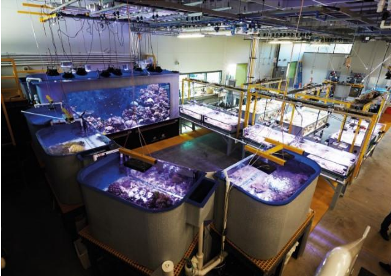
Australian Institute of Marine Science, Townsville