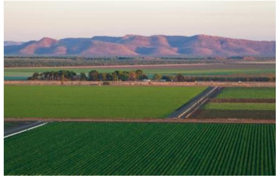
Ord Irrigation Scheme, and Kalumburu National Arbovirus Monitoring Program (NAMP), Western Australia.

PROTECTING our environment and industries