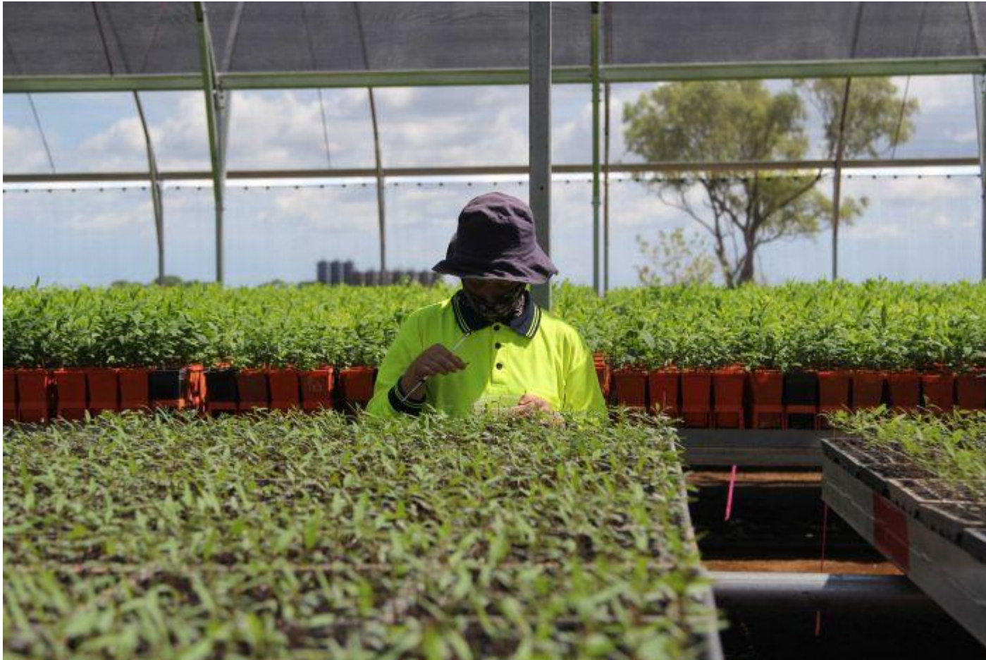
Indian sandalwood nursery in Katherine