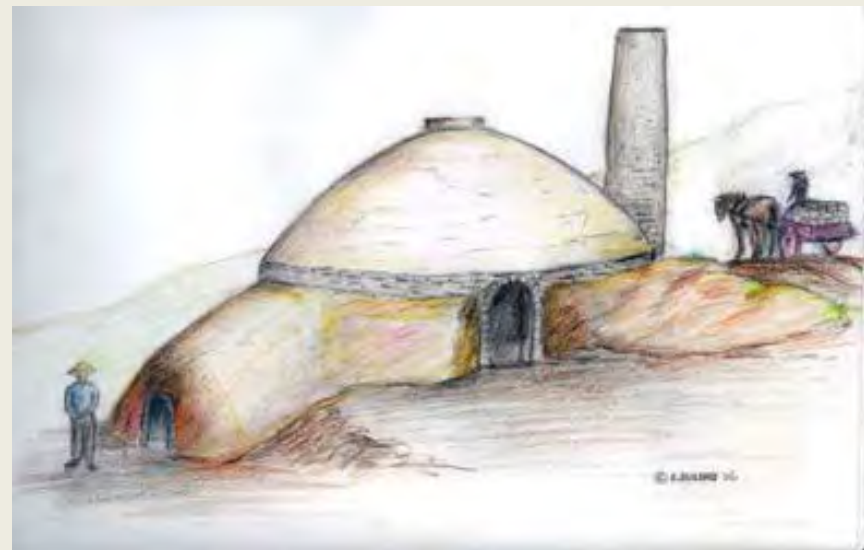
Chinese Kiln and Market Garden Bendigo (H2106)