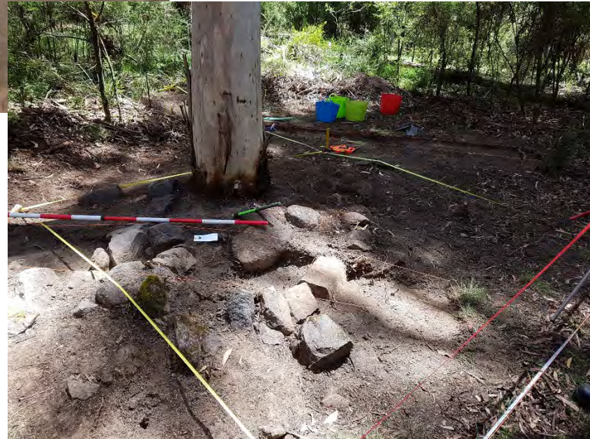
Stringybark Creek site (H2205)