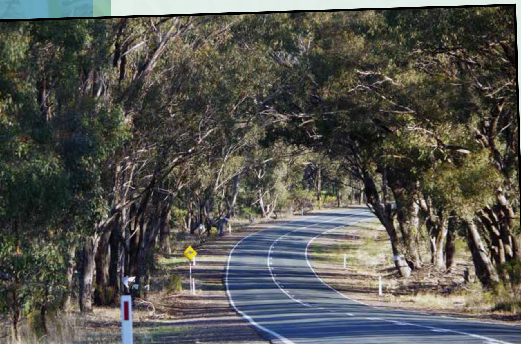
Left: A beautiful roadside at Rushworth that Edna Walling would be proud of.

(which is agency-wide). It meets monthly and began in April 2017.