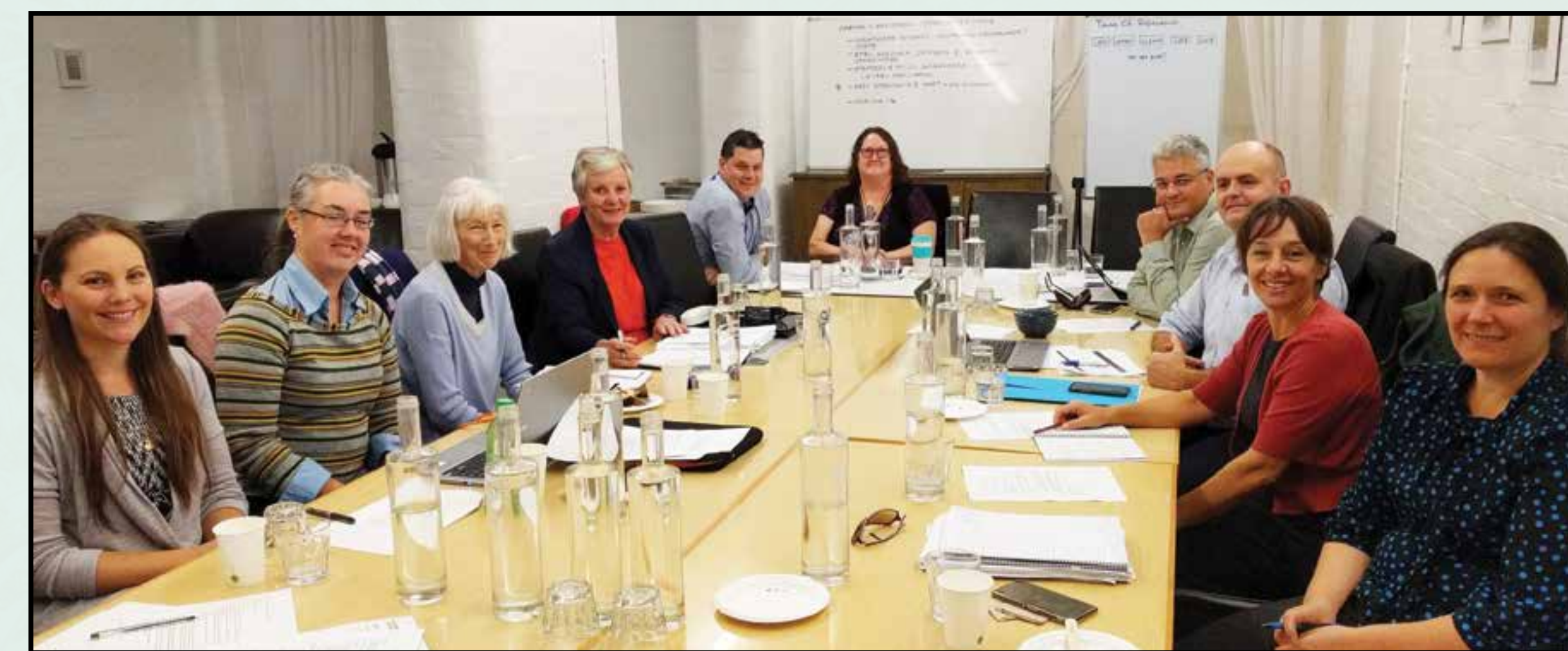
Above: The VREC includes PLAN members.