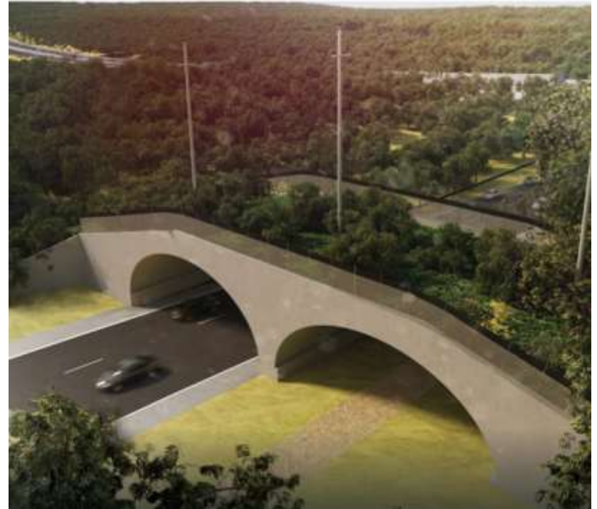
Illaweena Street fauna overpass (BEBO arch)