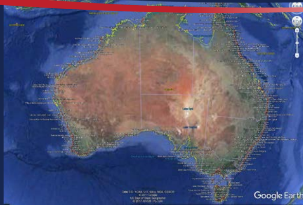
2814 clean-up locations