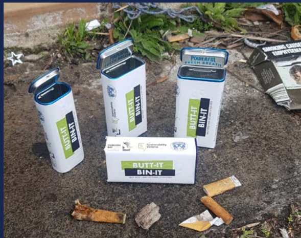
200 Source Reduction Plans