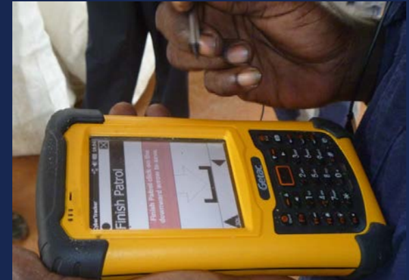
12.2 million items of data