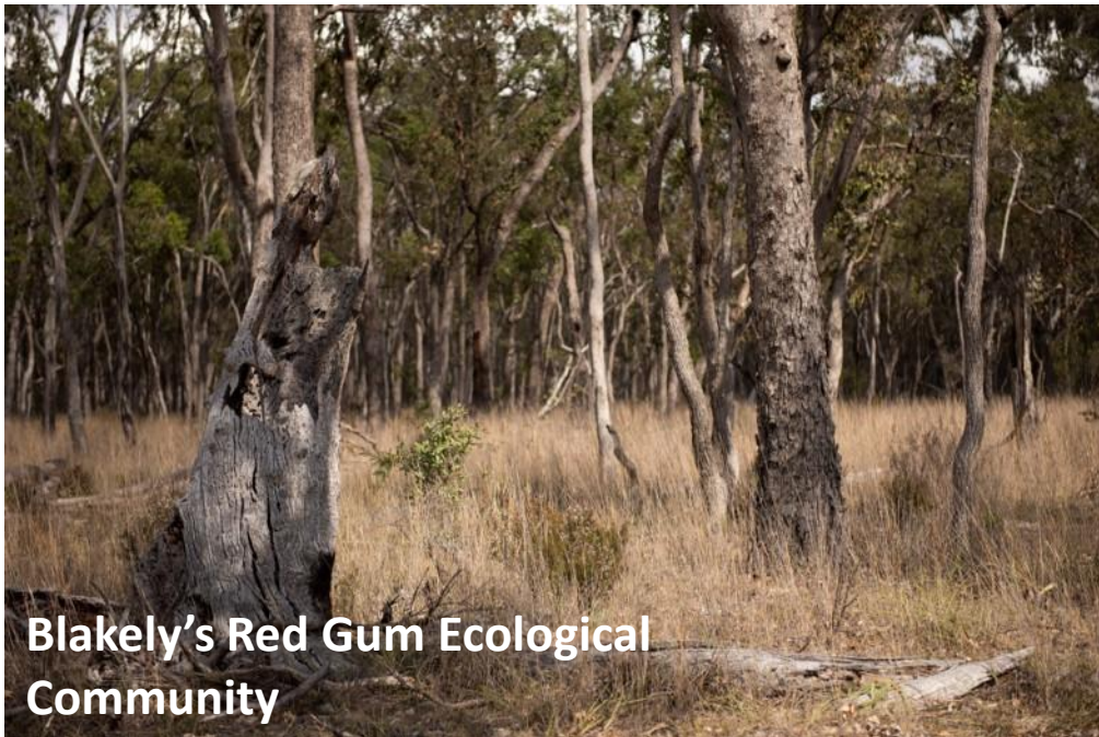
Blakely's Red Gum Ecological Community

BCT has funded 11 Conservation Agreements , 3,500 ha, worth $14.7 million. These 11 properties contain precious habitat such as critically endangered White Box – Yellow Box – Blakely’s Red Gum Ecological Communities . The region is also home to a variety of threatened fauna including turquoise parrots, powerful owls, koalas and spotted-tailed quolls .