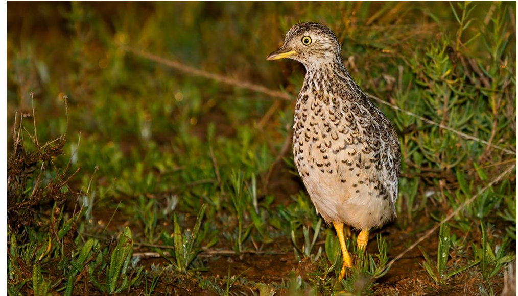
Critically endangered plains wanderer ( Pedionomus torquatus )