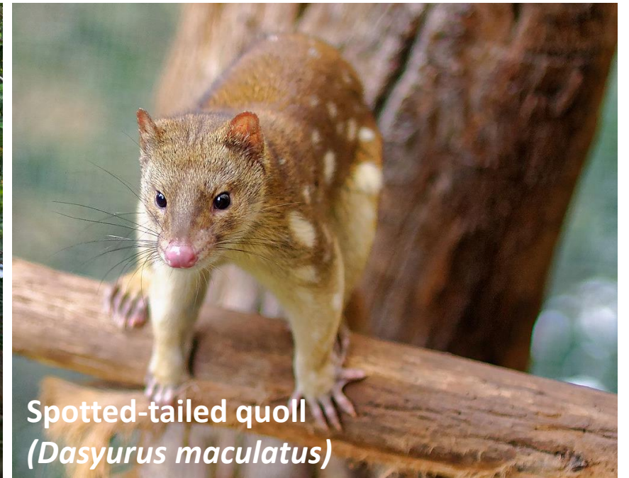
Spotted-tailed quoll ( Dasyurus maculatus )