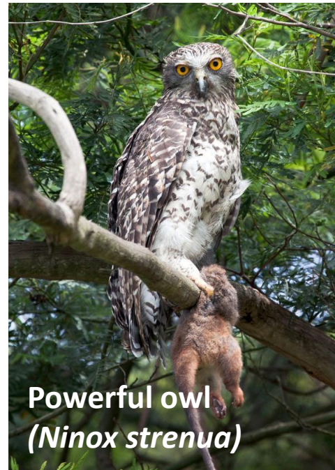
Powerful owl ( Ninox strenua )